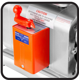
Controller made in Taiwan