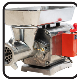
Made in Taiwan