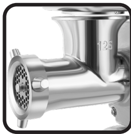
201 Stainless Steel Material